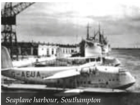
Seaplane harbour, Southampton