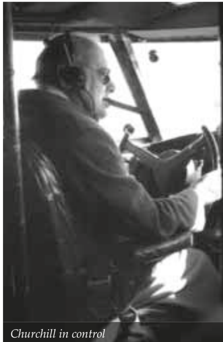
Churchill in control

Looking to the future of airliner development and how it is still moving forward, Tim explained that it is NOT down to the Airbus A380 SuperJumbo as we might expect. While this aircraft is impressive, larger than any previous passenger airline and extremely quiet, giving it passenger appeal, it doesn't open any new markets.