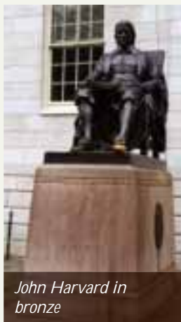
John Harvard in bronze