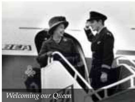
Welcoming our Queen

Looking to the future of airliner development and how it is still moving forward, Tim explained that it is NOT down to the Airbus A380 SuperJumbo as we might expect. While this aircraft is impressive, larger than any previous passenger airline and extremely quiet, giving it passenger appeal, it doesn't open any new markets.