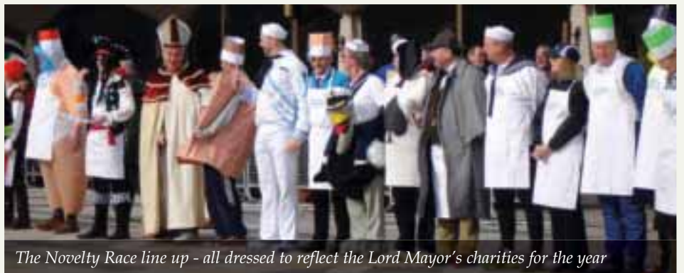
The Novelty Race line up - all dressed to reflect the Lord Mayor's charities for the year