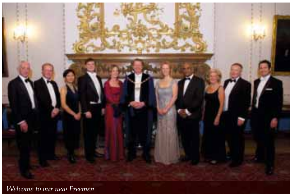
Welcome to our new Freeman