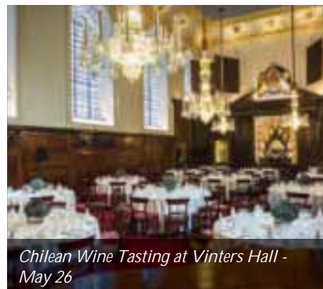
Chilean Wine Tasting at Vinters Hall - May 26

Good Marketing. In the case of Outreach it's pretty obvious and I am hoping for a step change in the engagement of Company members in our Outreach programme. I would prefer to see 100 members give just one day rather than ten members give ten days each. The volume output is the same but the engagement of members is clearly different. I suggested that, as this was a Leap Year, we all got that extra day on February 29. If you are salaried you weren't paid any more for working on that day so why not give it away? I hosted a meeting in my home where a number of members who live nearby gave a workshop to help the management of a charity I work with called Humanitas which believes that every child is entitled to healthcare, an education and a family. They strive to provide children across the globe with these three key rights.