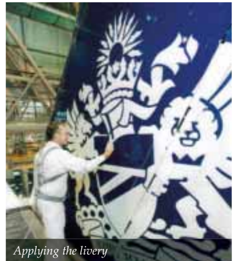
Applying the livery

Over the past five years, this strategy has re-energised the brand and significantly boosted brand bonding scores from -6 in 2010 to +3 in 2015. Not only that but