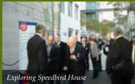
Exploring Speedbird House