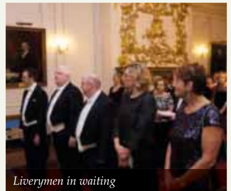
Liverymen in waiting