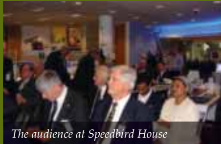
The audience at Speedbird House