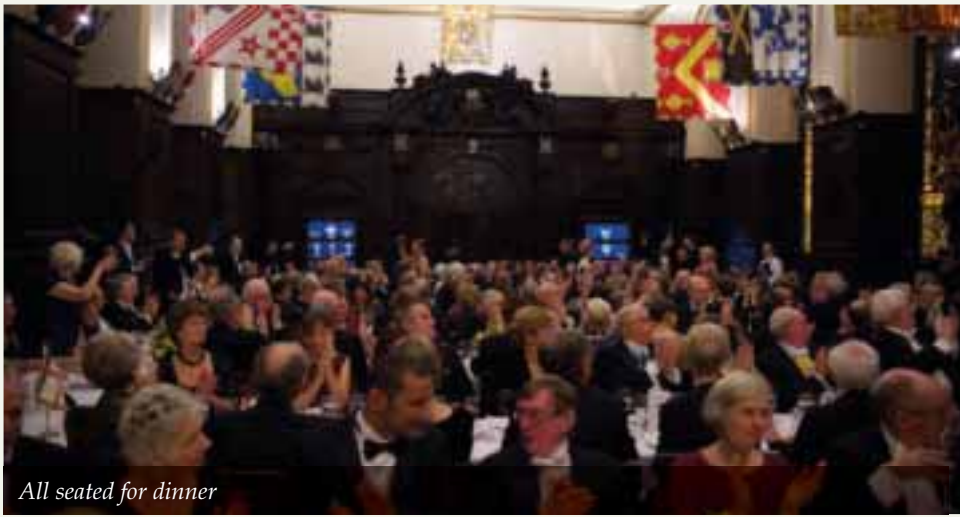
All seated for dinner