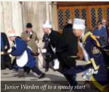
Junior Warden off to a speedy start