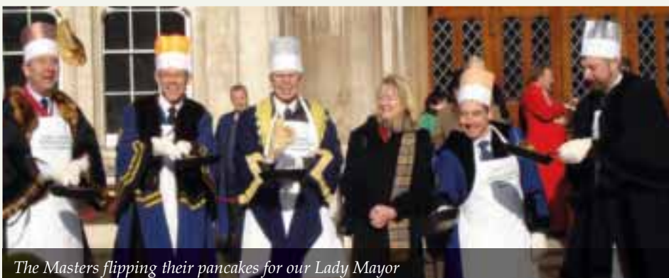
The Masters flipping their pancakes for our Lady Mayor