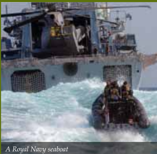
A Royal Navy seaboard

The aircraft had spotted that the vessel's engine hatch was open and that something was clearly wrong.