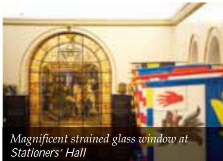
Magnificent stained glass window at Stationers' Hall

of printing, papermaking, packaging, office products, engineering, advertising, design, photography, film and video production, publishing of books, newspapers and periodicals and digital media. Recent honorary liverymen of the Stationers include Rupert Murdoch and David Starkey.