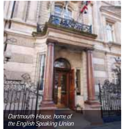
Dartmouth House, home of the English Speaking Union