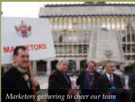
Marketors gathering to cheer our team