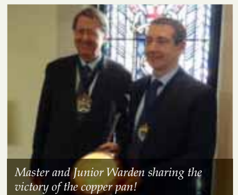
Master and Junior Warden sharing the victory of the copper pan!