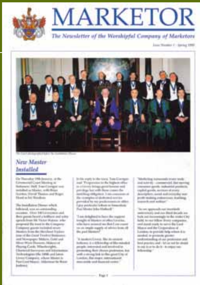
The very first Marketor magazine