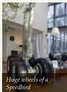
Huge wheels of a Speedbird

'Thank you for organising an interesting and educational visit. Now we all know a little more about the world's favourite airline. Fly to serve.'