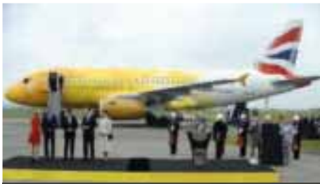
Delivering the Olympic flame in 2012