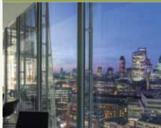
View from Warwick Business School in the Shard