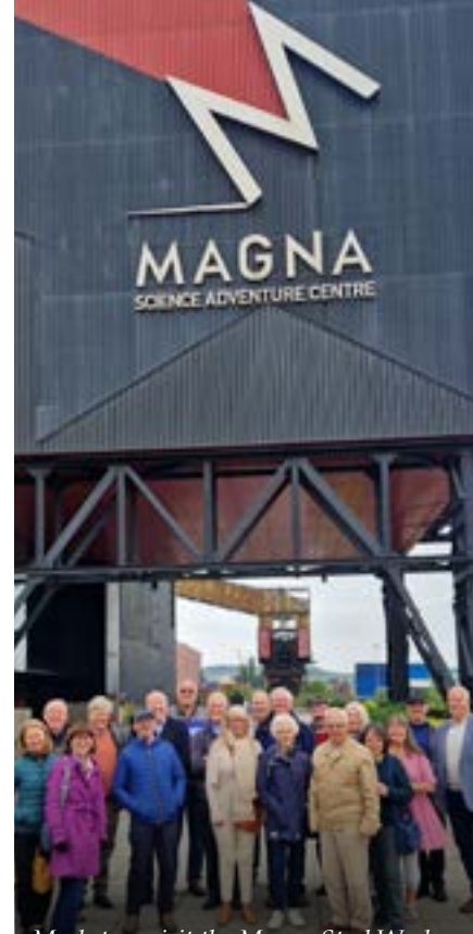
Marketors visit the Magna Steel Works